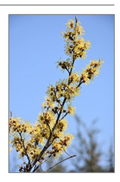
Arnold Promise Witchhazel flowers