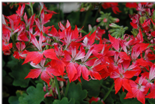
Fireworks Red White Geranium flowers