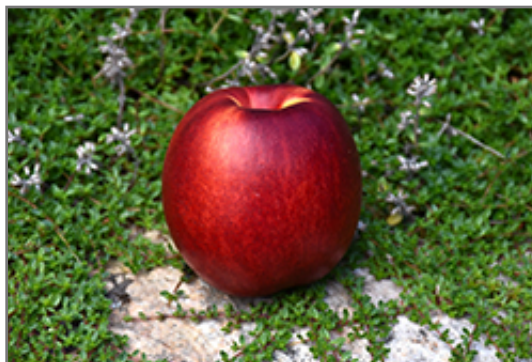
Fantasia Nectarine fruit

This is a deciduous tree with a more or less rounded form. Its average texture blends into the landscape, but can be balanced by one or two finer or coarser trees or shrubs for an effective composition. This plant will require occasional maintenance and upkeep, and is best pruned in late winter once the threat of extreme cold has passed. Gardeners should be aware of the following characteristic(s) that may warrant special consideration;