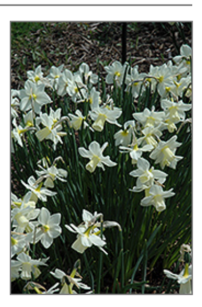
Curlew Daffodil flowers

A gorgeous addition to any garden, this variety produces flowers that are bright white with pale yellow cups that mature to ivory; very showy in the garden or containers