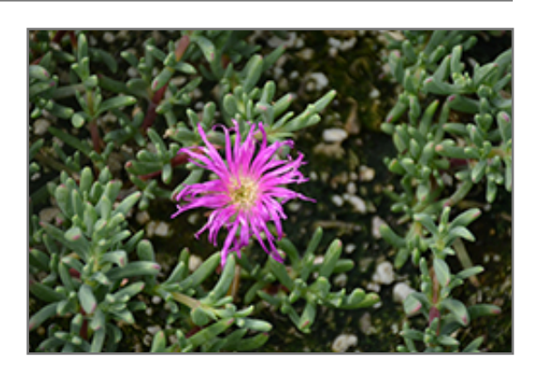
Purple Iceplant flowers