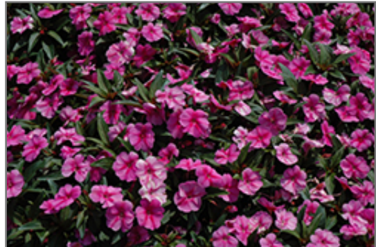
Bounce Pink Flame Impatiens flowers