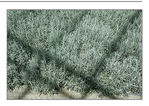
Strawflower foliage