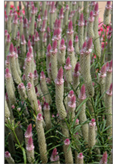
Flamingo Feather Celosia foliage