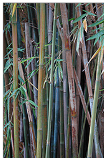
Graceful Bamboo bark