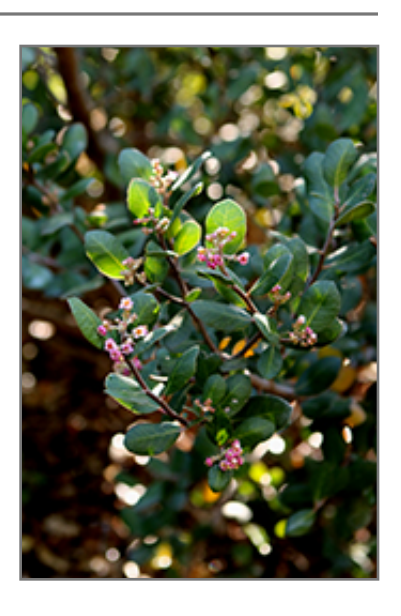
Big Berry Manzanita flowers