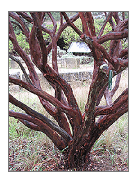
Big Berry Manzanita bark