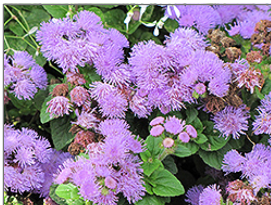
Artist Alto Blue Flossflower flowers