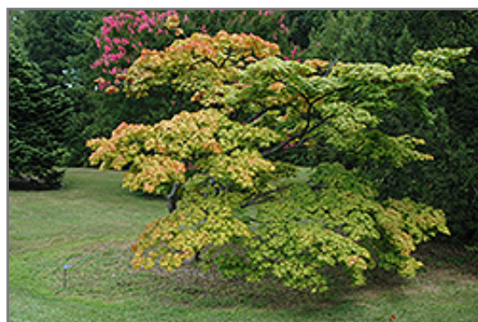
Mon Zukushi Japanese Maple