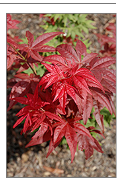
Beni Hoshi Japanese Maple foliage