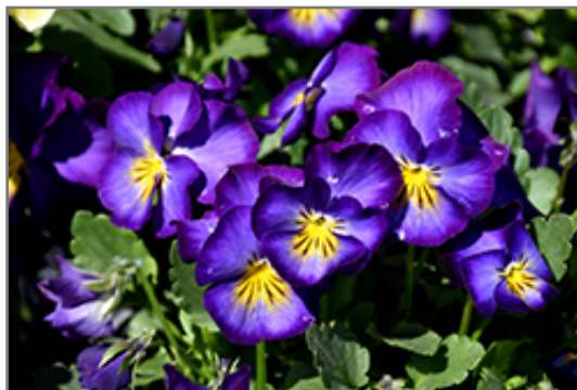
Halo Violet Pansy flowers

Halo Violet Pansy is recommended for the following landscape applications;