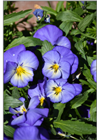
Halo Sky Blue Pansy flowers

Halo Sky Blue Pansy is recommended for the following landscape applications;