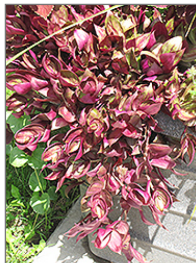
Purple Wandering Jew