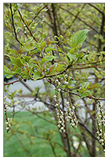
Variegated Golden Spiketail flowers