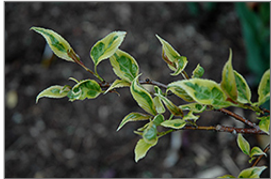
Variegated Golden Spiketail foliage

This plant is not reliably hardy in our region, and certain restrictions may apply; contact the store for more information.