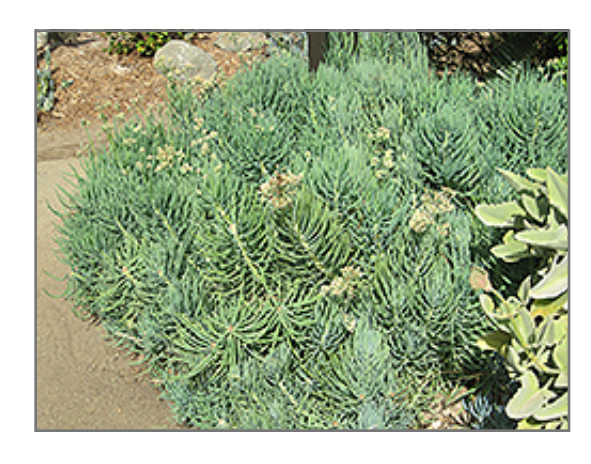
Jolly Gray Hybrid Kleinia in bloom

This is a relatively low maintenance plant, and usually looks its best without pruning, although it will tolerate pruning. It has no significant negative characteristics.