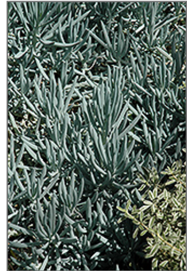
Blue Chalk Sticks foliage