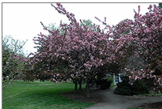
Strawberry Parfait Flowering Crab in bloom