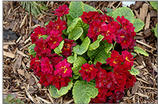
Corporal Baxter Primrose in bloom