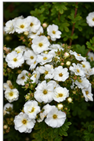
Morden Snow Potentilla flowers