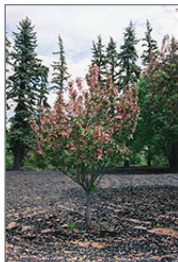
Shaughnessy Cohen Flowering Crab in bloom