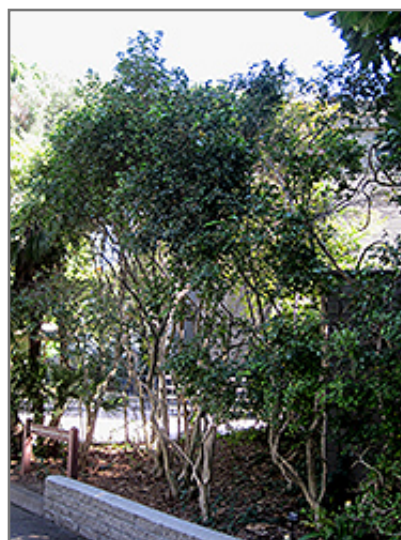
Orange Jessamine