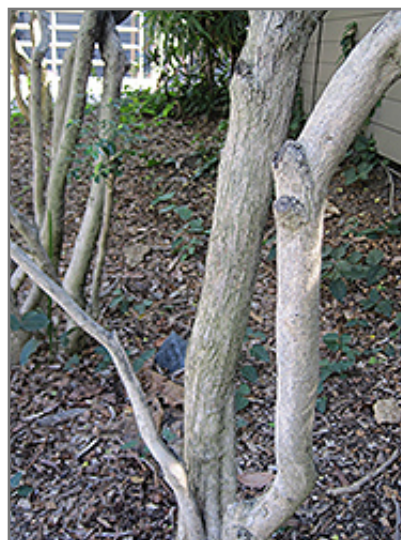
Orange Jessamine bark