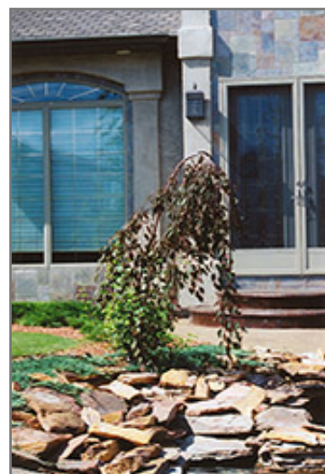
Royal Beauty Flowering Crab