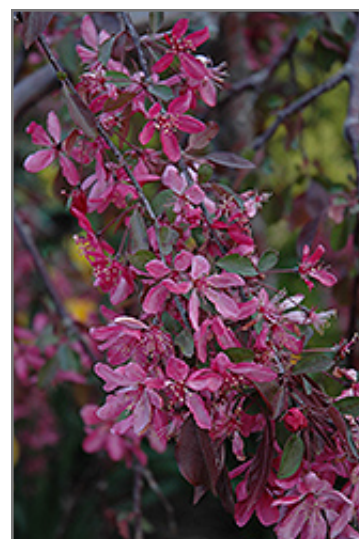
Rosy Glo Flowering Crab flowers