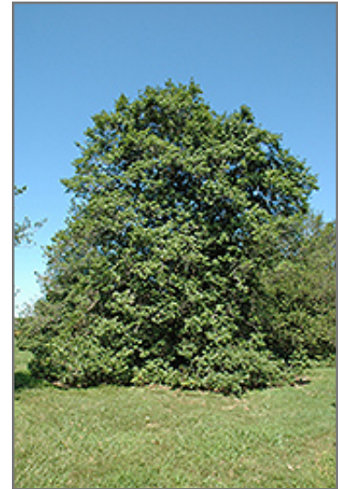
Carnival American Holly