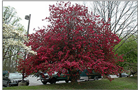
Burgundy Flowering Crab in bloom