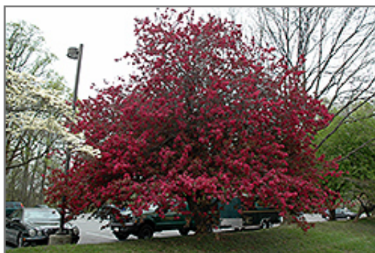
Burgundy Flowering Crab in bloom