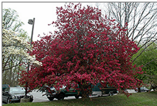
Burgundy Flowering Crab in bloom