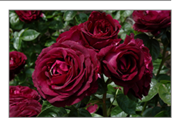
Twilight Zone Rose flowers