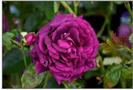
Twilight Zone Rose flowers