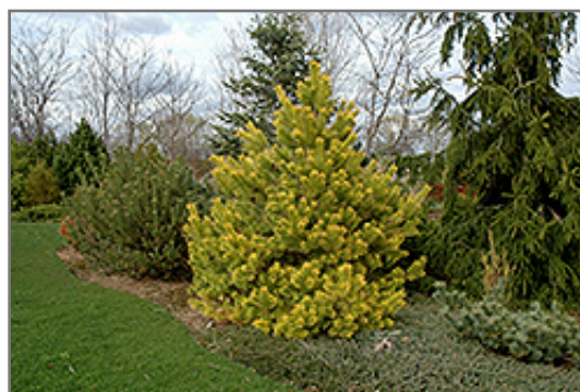
Wolting's Gold Scotch Pine