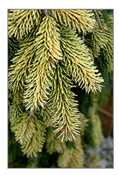
Gold Drift Norway Spruce foliage