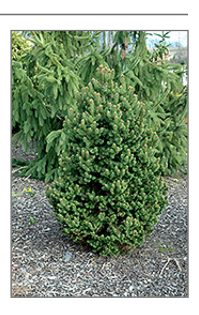
Emsland Norway Spruce

Emsland Norway Spruce will grow to be about 7 feet tall at maturity, with a spread of 5 feet. It tends to fill out right to the ground and therefore doesn't necessarily require facer plants in front, and is suitable for planting under power lines. It grows at a slow rate, and under ideal conditions can be expected to live for 50 years or more.