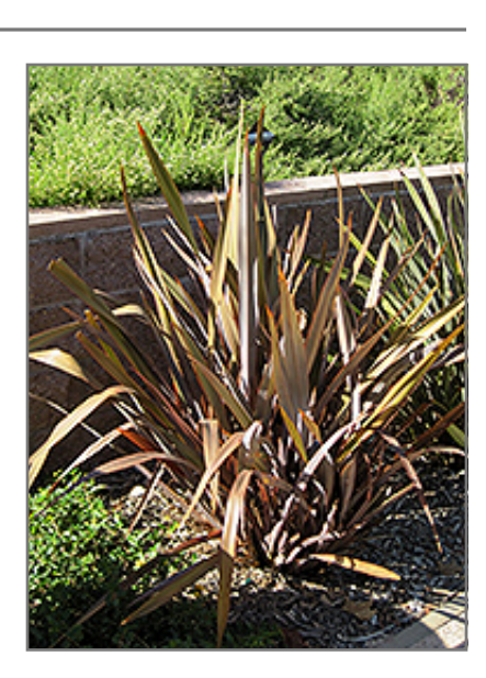
Dusky Chief New Zealand Flax