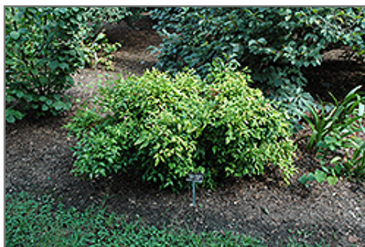
Wood's Dwarf Nandina