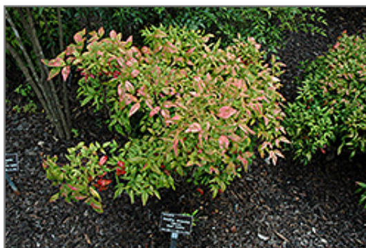
Okame Nandina