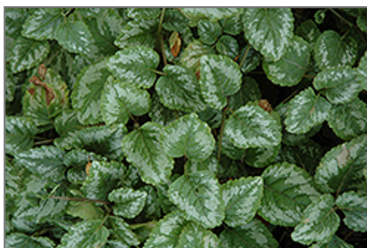
Jade Frost Archangel foliage