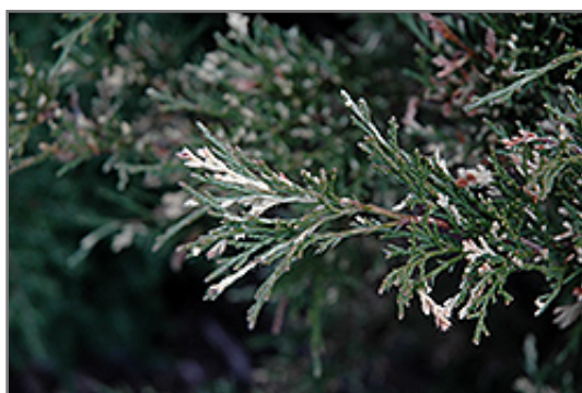
Variegated Savin Juniper foliage