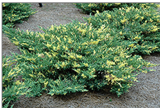
Variegated Japanese Juniper