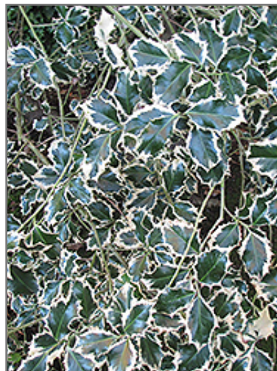
Variegated English Holly foliage

Variegated English Holly will grow to be about 25 feet tall at maturity, with a spread of 20 feet. It has a low canopy with a typical clearance of 2 feet from the ground, and should not be planted underneath power lines. It grows at a medium rate, and under ideal conditions can be expected to live for 50 years or more.