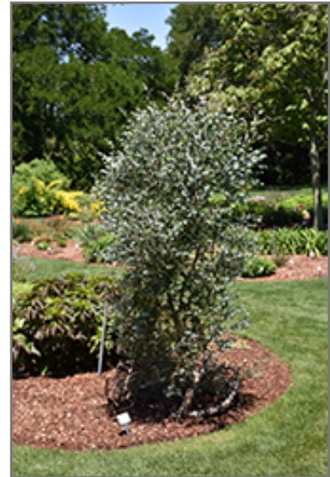
Silver Drop Cider Gum

This plant is not reliably hardy in our region, and certain restrictions may apply; contact the store for more information.