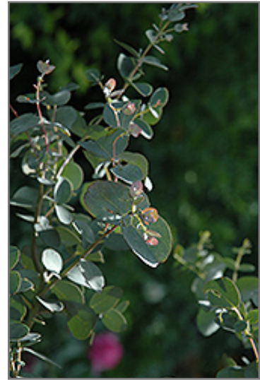
Silver Drop Cider Gum foliage