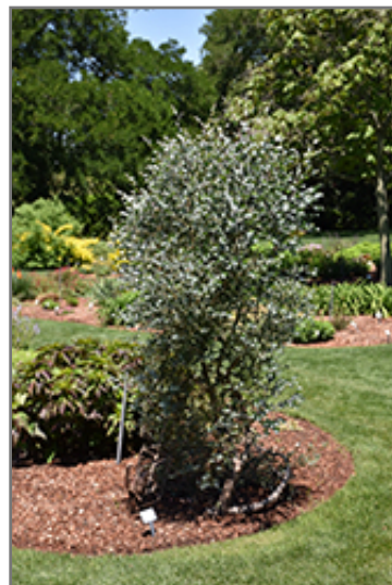
Silver Drop Cider Gum

This plant is not reliably hardy in our region, and certain restrictions may apply; contact the store for more information.