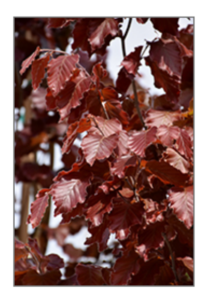
Red Obelisk Beech foliage