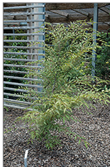
Silver Lace Japanese Hornbeam