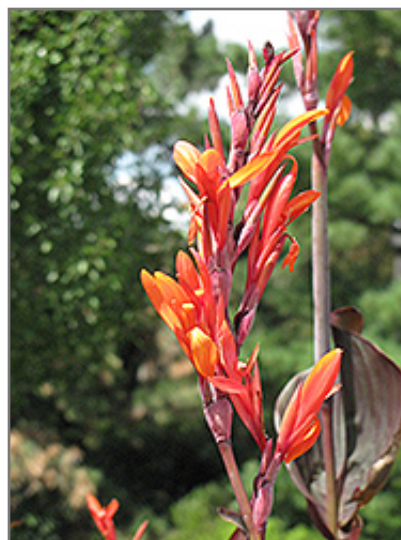
Paprika Canna flowers

This plant should only be grown in full sunlight. It requires an evenly moist well-drained soil for optimal growth, but will die in standing water. It is not particular as to soil pH, but grows best in rich soils. It is highly tolerant of urban pollution and will even thrive in inner city environments, and will benefit from being planted in a relatively sheltered location. Consider applying a thick mulch around the root zone in winter to protect it in exposed locations or colder microclimates. This particular variety is an interspecific hybrid. It can be propagated by division; however, as a cultivated variety, be aware that it may be subject to certain restrictions or prohibitions on propagation.