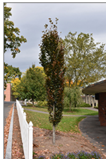
Dawyck Purple Beech