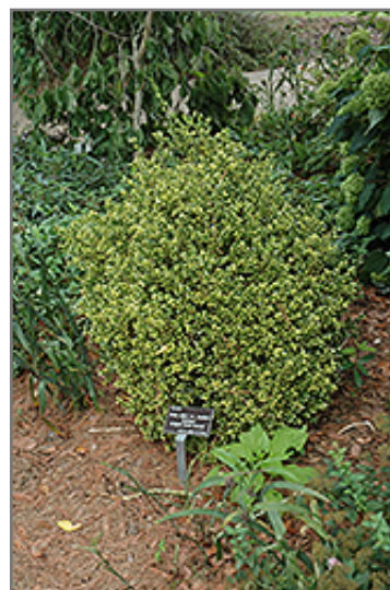
Sunburst Variegated Korean Boxwood