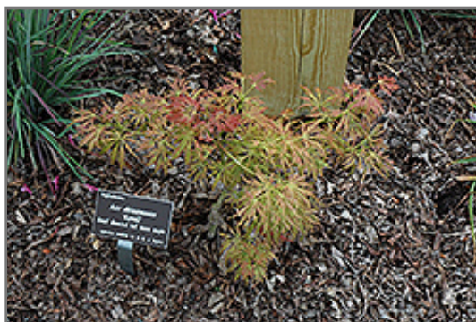
Kawaii Full Moon Maple

Kawaii Full Moon Maple will grow to be about 18 inches tall at maturity, with a spread of 24 inches. It has a low canopy. It grows at a slow rate, and under ideal conditions can be expected to live for 50 years or more.