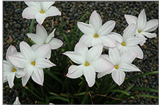
Big Dude Rain Lily flowers