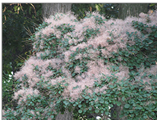
American Smoketree in bloom