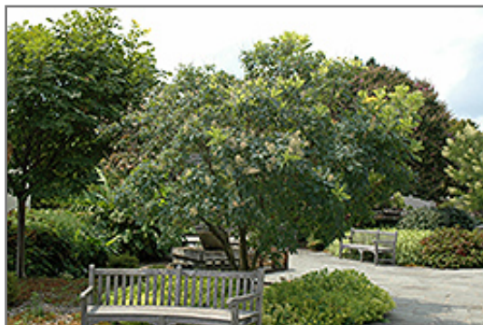
American Smoketree in bloom