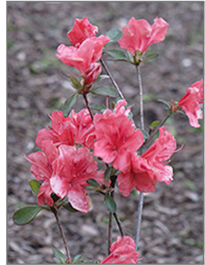
Red Wing Azalea flowers

Red Wing Azalea will grow to be about 4 feet tall at maturity, with a spread of 6 feet. It tends to be a little leggy, with a typical clearance of 1 foot from the ground. It grows at a slow rate, and under ideal conditions can be expected to live for 40 years or more.