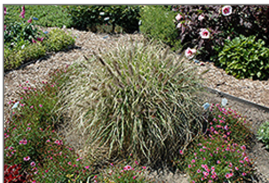
Ginger Love Fountain Grass